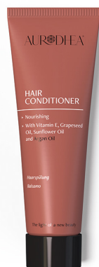
PHOTO OF THE PRODUCT