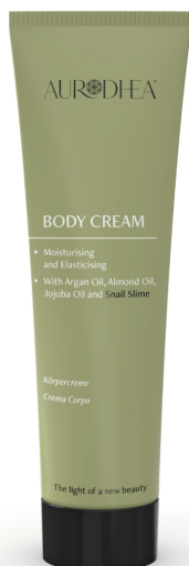
PHOTO OF THE PRODUCT