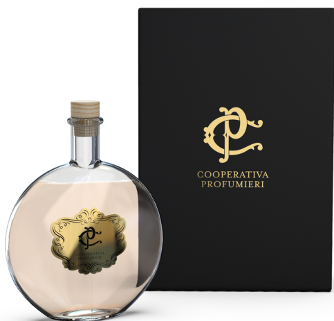
PHOTO OF THE PRODUCT