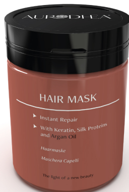
PHOTO OF THE PRODUCT